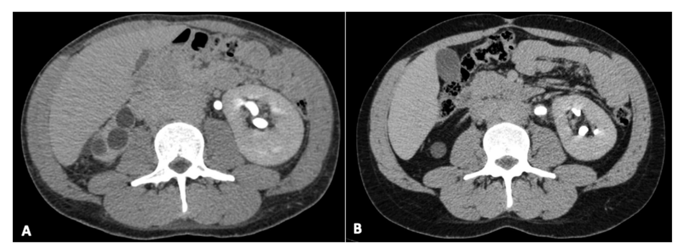
Figure 1. Abdominal CT axial plane: \mathbf{A} – Initial examination on admission. Note large mass involving the abdominal aorta; \mathbf{B} – CT scan performed 7 months after the first examination and under treatment with corticosteroid. Note the expressive reduction of the periaortic mass.

The immunohistochemical examination (Table 2) showed an increased number of IgG4 positive plasma cells. The IgG4/IgG ratio of 30% and approximately 80 IgG4 positive-plasma cells per high-power field (HPF) in areas of more density. This examination, together with the morphological and clinical findings, is highly suggestive of IgG4-RD.