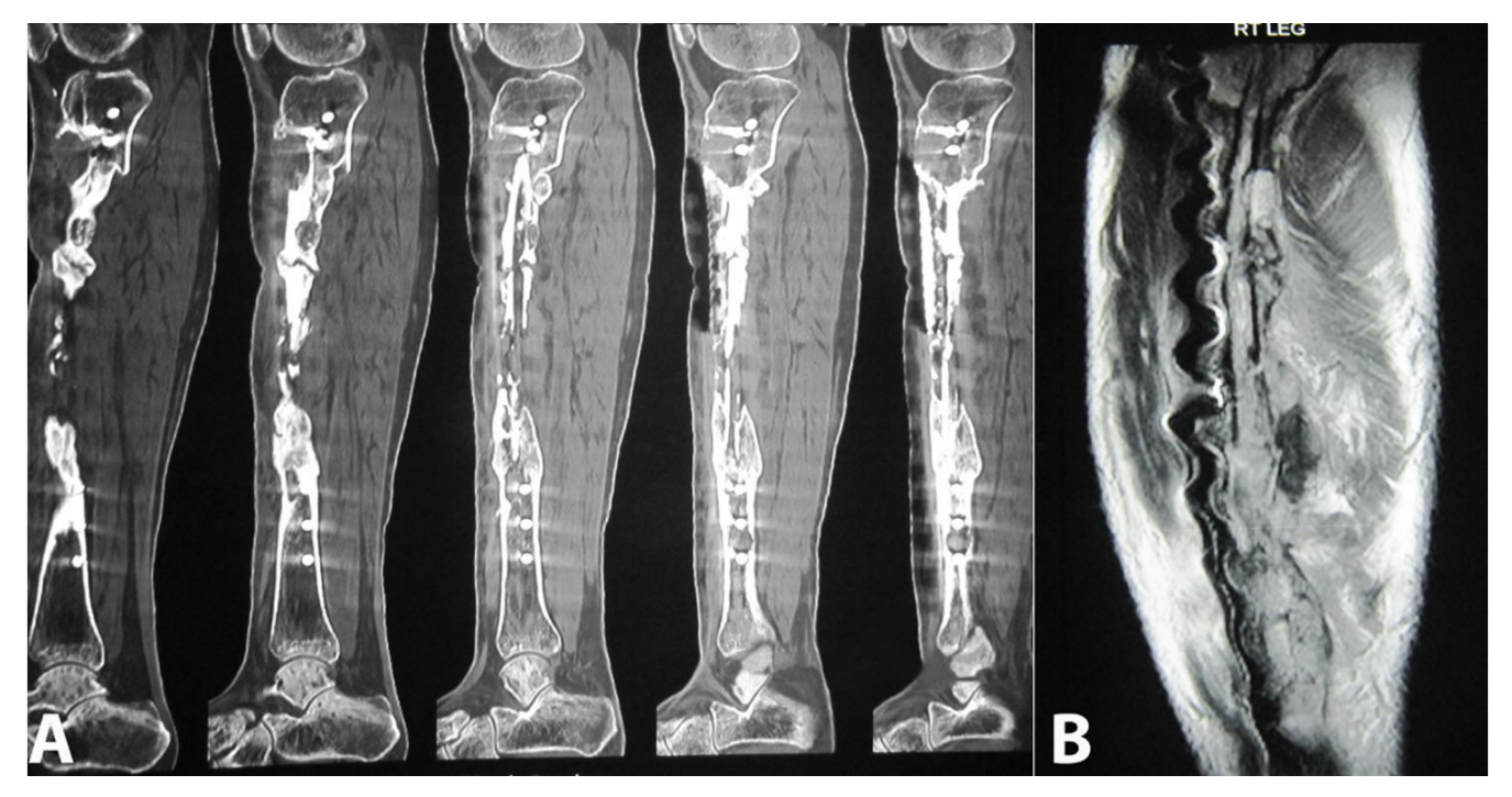
Figure 3. CT study of right leg: \mathbf{A} – Sagittal sections reveal multiple patchy cortical erosions/irregularities in the right tibia centered in the diaphysis and contiguously involving the adjacent upper metaphysis. Note adjoining soft tissue thickenings. Streak artifacts are noted due to postoperative changes (Screws); \mathbf{B} – MRI Sagittal section of right leg reveals cortical erosions/irregular outlines of the tibia with altered signals in the adjoining bone marrow and soft tissue. Susceptibility artifacts are noted due to postoperative metallic screws.

nests of basaloid cells with distinctive peripheral palisading. The squamous variant with or without keratinization may resemble well-differentiated squamous cell carcinoma. The spindled form shows uniform spindling with the presence of clefts lined by epithelial cells. The pattern of osteofibrous dysplasia predominantly characterizes the histologic features of the differentiated adamantinoma. Foci of calcification, giant cells, xanthoma, and spindle cells have also been described in adamantinoma. Izquierdo et al.<sup>16</sup> reported an adamantinoma case with a sarcomatoid transformation that showed a complete loss of epithelial differentiation, and Povýšil et al.<sup>17</sup> reported a rhabdoid variant of differentiated adamantinoma.