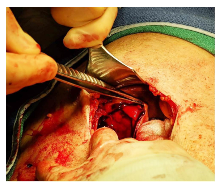
Figure 2. Intraoperative photograph after conversion to open cholecystectomy demonstrating perforation and near complete rupture of gallbladder.

After the bleeding was controlled, a subtotal fenestrating cholecystectomy was performed with a cystic duct orifice purse-string suture and the remaining mucosa underwent electrocautery to minimize risk of fistula. A drain was also placed in the right upper