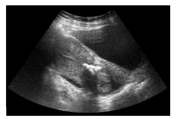
Figure 1. Pelvic Ultrasound showing heterogenous & hyperechoic content with multiple calcific foci within the endometrial cavity.