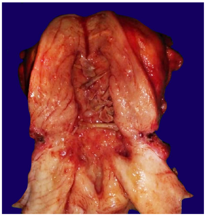
Figure 3. Gross view of the surgical specimen showing a simple hysterectomy with retained fetal bones in the endometrial cavity.

Intrauterine bone fragments are an unexpected finding in a hysterectomy specimen received in the Pathology Department for morphological examination. The clinical presentation of IUBF is non-specific and includes vaginal discharge, bleeding, leucorrhoea, secondary infertility, chronic pelvic pain, and dysmennorrhea.<sup>1</sup> Makris et al.<sup>2</sup> reported the incidence of 0.15% in 2000 diagnostic hysteroscopies, while this incidence was 0.26% in 1002 hysteroscopies in the study of Okohue,<sup>3</sup> in Nigeria (where abortion laws are highly restrictive). Gainder S et al.<sup>4</sup> reported the incidence of IUBF of 0.28% in144 women with infertility. These women were diagnosed to have retained fetal bones on the pelvic sonogram, which was later confirmed and removed by hysteroscopy.