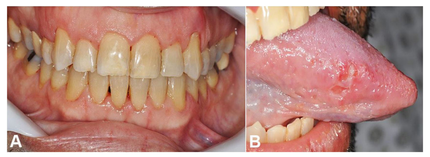
Figure 4. Oral examination. A – Clinical appearance of the gingiva after the first cycle of chemotherapy; B – Clinical appearance of the tongue after the first cycle of chemotherapy and biopsy.