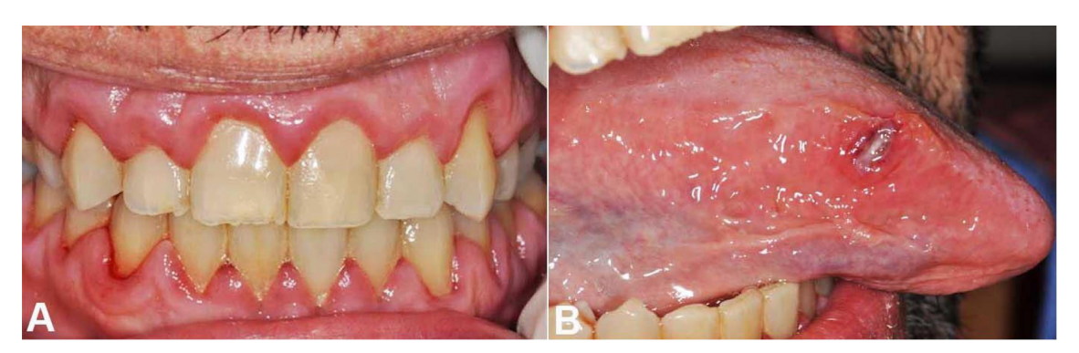
Figure 1. Oral examination. A – Generalized gingival enlargement associated with marginal petechiae; B – Right lateral border of the tongue showing a hardened and ulcerated lesion.

Despite the high suspicion of leukemic infiltration of the tongue, we assume it was nonspecific ulceration and performed an excisional biopsy of the tongue, taking into account the differential diagnosis of an eosinophilic ulcer of the oral mucosa. The histological examination showed poorly-differentiated hematolymphoid cells, with the presence of eosinophilic and neutrophilic cells, consistent with myeloid sarcoma. The immunohistochemistry panel showed positivity for CD45, CD68, lysozyme, MPO, and CD15 (Figure 2), confirming our diagnostic hypothesis.