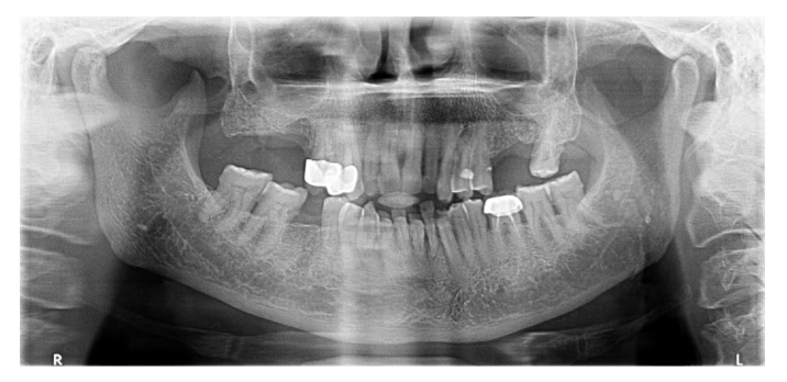
Figure 2. Radiographic examination: without bone involvement.