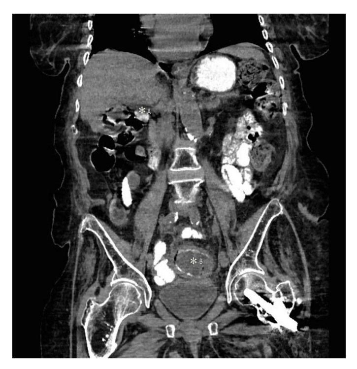
Figure 1. Abdominal computed tomography from the emergency room showing a stone in the gallbladder with pneumobilia – A ; and another stone in the sigmoid colon – B .

pain after an enema. By the third hospital day, she was hypotensive and septic with increasing abdominal pain. Surgical intervention or colonoscopy was no longer considered possible. The family agreed to comfort care. The patient died on the third hospital day.