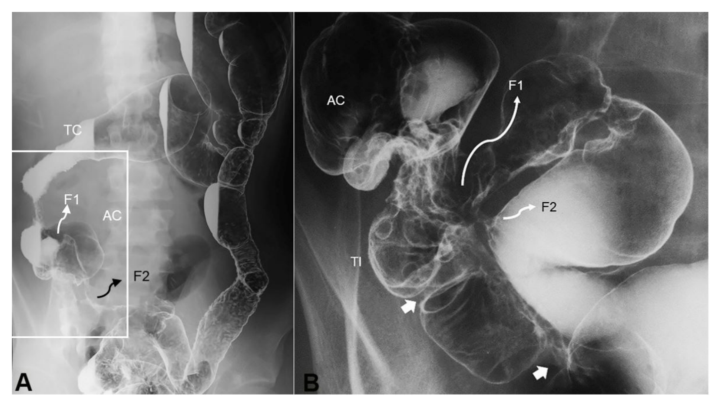
Figure 4. Double-contrast barium enema study. Entire picture of the colon ( A ) and enlarged picture of the ileocolic portion ( B ). A – Shortening of the right colon is seen. Diffuse coarse mucosa from the sigmoid colon to the distal part of the descending colon is observed. B - Two stenotic sites in the terminal ileum are indicated by white arrows. There are two entero-enteric fistulas indicated by F. TC, transverse colon; AC, ascending colon; TI, terminal ileum; F, fistula.