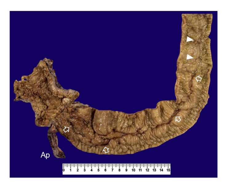
Figure 3. Gross examination of the resected specimen of case 1. Two round ulcers at the proximal site (arrowheads) and a longitudinal ulcer of 30 cm (arrows) are seen in the terminal ileum. Cobblestone appearance is seen in the ascending colon. The appendix (Ap) is swollen.

CDAI = Crohn disease activity index; CRP = C-reactive protein; ESR = erythrocyte sedimentation rate; FOB = fecal occult blood; Hb = hemoglobin; IFX; infliximab; n.a. = not available; T. cholesterol = Total cholesterol; T. protein = total protein; WBC = white blood cells.