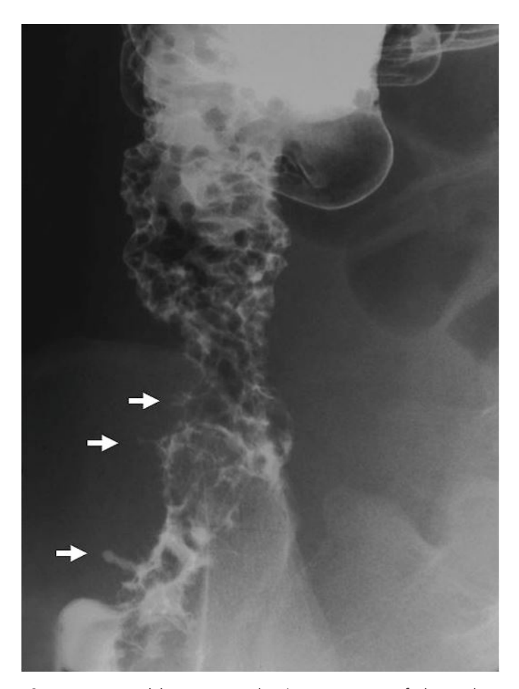
Figure 1. Double-contrast barium enema of the colon showing inflammation of the ascending colon and the cecum. The bowel is narrowed at the lower portion of the ascending colon. Cobblestone appearance is seen in the upper portion of the ascending colon. Fissurings are indicated by arrows.

The patient received liquid infusion without meals during morphological studies to assess clinical types and intestinal stenosis. Enteroclysis revealed stenotic portions and longitudinal ulcers in the distal portion of the ileum (Figure 2C). On the 8th hospital day, infliximab 300 mg (Remicade 5 mg/kg; Centocor, Malvern, PA, USA) was infused.<sup>8</sup> A plant-based diet<sup>1,2</sup> (1700 kcal/day) was initiated on the day after the infusion. Laboratory data 1 week after the infusion showed apparent improvement (Table 1), and the patient felt better after the 1st infusion of infliximab. However, on the 13th day, he presented abdominal distension after the first infusion. Intestinal obstruction was diagnosed due to clear air-fluid levels on plain abdominal radiographs (Figure 2B).