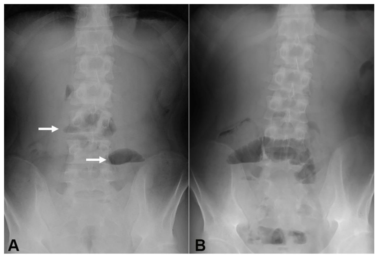
Figure 5. Plain abdominal radiographs on the 11th day after the first infusion of infliximab ( A ) and the day following resumption of meals after the 3rd infliximab infusion ( B ). Air-fluid levels are indicated by arrows ( A ).