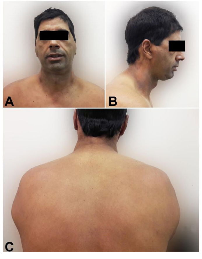
Figure 3. Early post-operative examination showing a favorable esthetic result in both the cervical region ( A and B ) and the back ( C ).