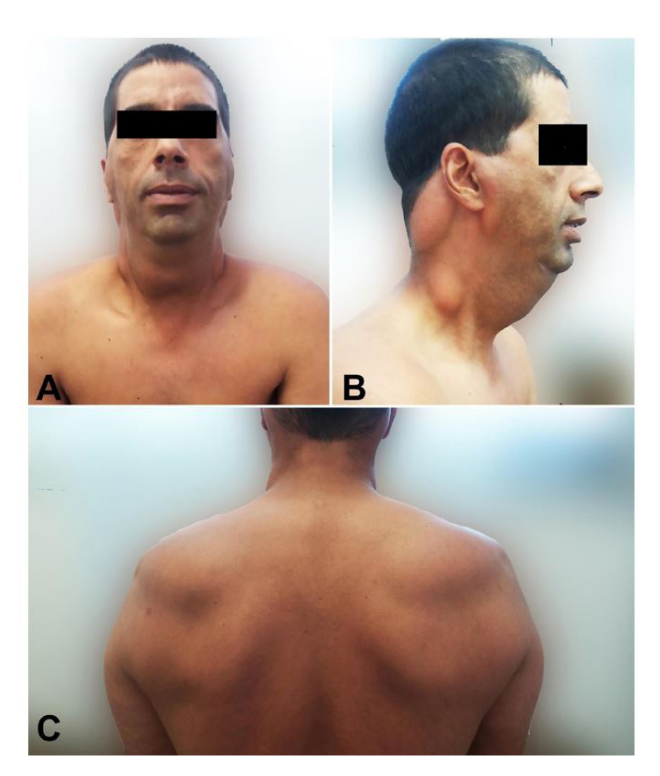
Figure 1. Pre-operative examination. Note the tumors in A and B – the anterior cervical submandibular regions, and pre- and post-auricular regions; and C – in the back.

The anatomopathological study of the masses showed a mature adipocyte proliferation, which was compatible with lipomatosis.