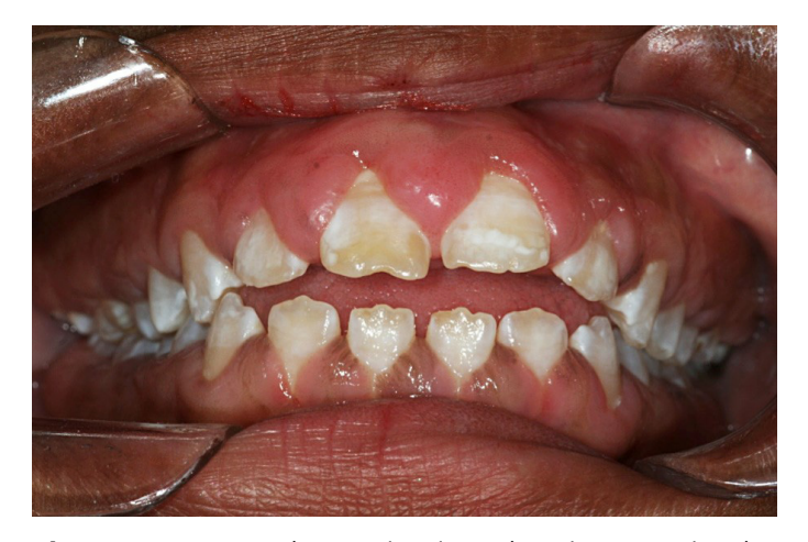
Figure 1. Intraoral examination showing GO in the anterior region of both arches.

Calcium channel blockers act directly on vascular smooth muscle, reducing systemic vascular resistance and improving renal blood flow, thereby reducing the systemic blood pressure.<sup>15</sup> Some studies<sup>11,16,17</sup> showed the incidence of GO ranging between 1.3%