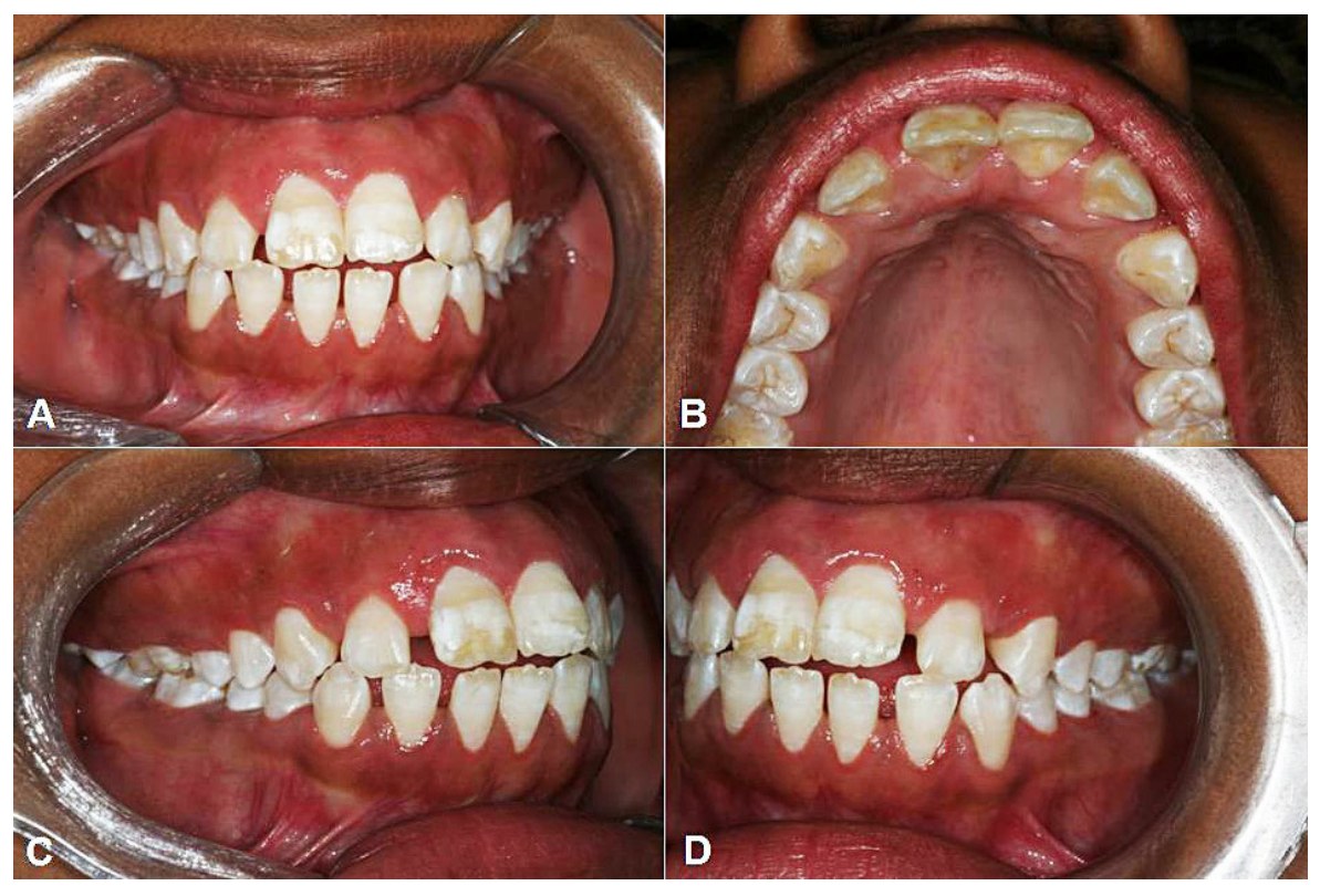
Figure 3. Intraoral examination after 28 months of follow-up, with no recurrence of gingival overgrowth. A - Anterior view; B - Occlusal view; C - Right side view; and D - Left side view.