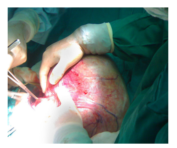
Figure 3. Gross view of the cyst during the salpingo-oophorectomy.