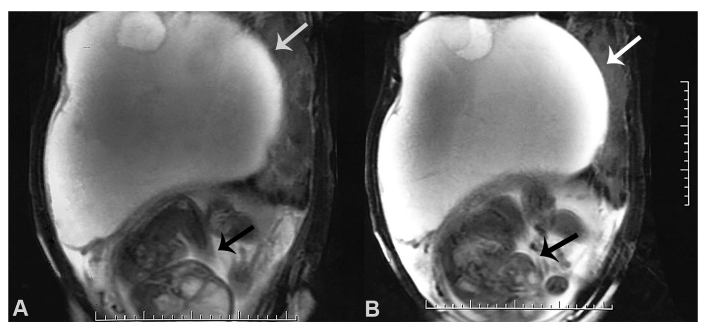
Figure 1. A and B - T2-weighted magnetic resonance imaging of the abdomen showing the gravid uterus with single fetus (black arrows), cephalic presentation and back to the right, and a voluminous cyst with apparent excrescence in the inferior aspect (white arrow).

On immunohistochemical research, these cells were positive for vimentin and inhibin (Figure 5). Estrogen and progesterone receptors and human chorionic gonadotropin (HCG) were negative.